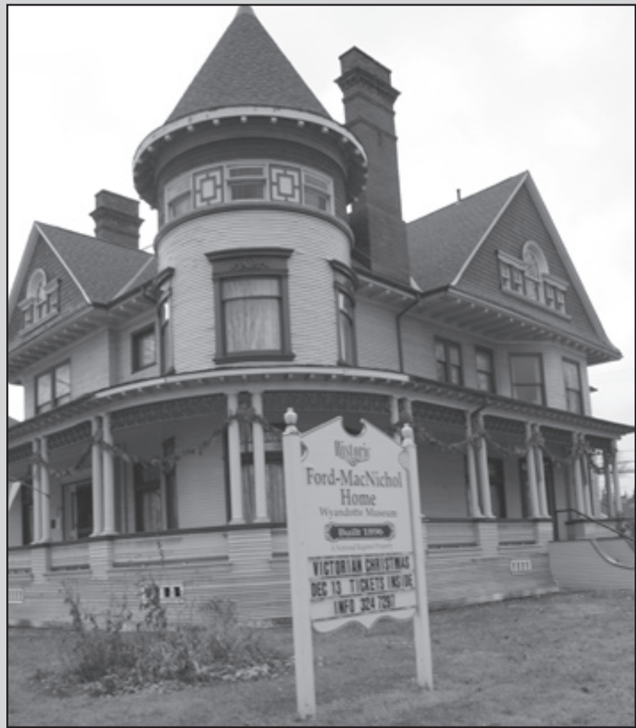
The Ford MacNichol home located downtown Wyandotte is preparing for a Victorian Holiday open house on December 19.