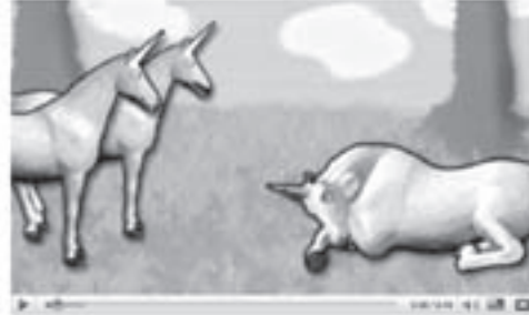
Charlie The Unicorn