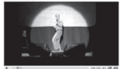
Evolution of Dance